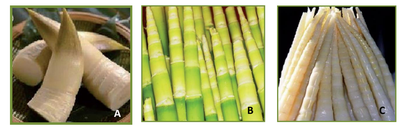
Figure 8. Bamboo shoots for food: Sinocalamus latiflorus (A), Pleioblastus sp. (B and C) (from Troya and Xu, 2014, p.9).

Bamboo shoots are a major source of food in many parts of the world, and the bamboo-shoot industry is extensive (Fig. 8). The main constituents of bamboo shoots include protein, amino acids, fat, saccharides, and minerals, and bamboo shoots rank highest among vegetables in protein content (Yuming & Chaomao, 2010, p.149). Growing bamboo for shoot supply may be part of the answer in providing food security to those communities which are struggling to obtain sufficient food to eat (Basumatary, et al., 2015). Bamboo shoot harvesting however, as with culms, is seasonal, and harvesting of shoots while underground can yield higher protein and amino acid content (Troya & Xu, 2014). Bamboo shoots are now processed into many kinds of food, including fresh shoots, dry shoots, and canned shoots, and are sold around the world, and some new products, such as bamboo candy, bamboo chutney, bamboo canned juice and bamboo beer are also available (Troya & Xu, 2014).