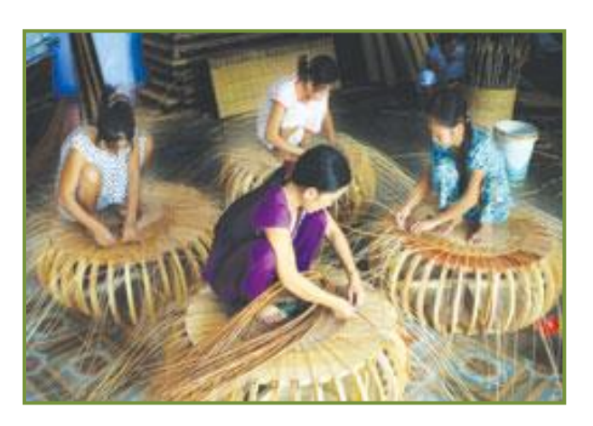
Figure 6 . Bamboo weaving in Bao La Village has helped to raise people out of poverty by providing them with extra income (photo VNA/VNS Photo Nguyen Thuy).

Bamboo is used to make an array of craft and domestic items, such as furniture, mats, baskets, tools and tool handles, hats, traditional toys, musical instruments, trays, bottles, jars, boxes, cases, bowls, fans, screens, curtains, cushions, lampshades, lanterns and toothpicks (INBAR, 2014; Patel, 2005). Nontimber forestry, and particularly bamboo, is closely attached to almost 24 million mountainous ethnic people in Viet Nam, and in 2010 the country had more than 2,000 traditional craft villages, with 723 of them involved in traditional bamboo and rattan weaving (VietNamNewsToday.com, 2010). Good examples of such craft villages are Thai My village in Cu Chi District (Vietnam Pictorial,