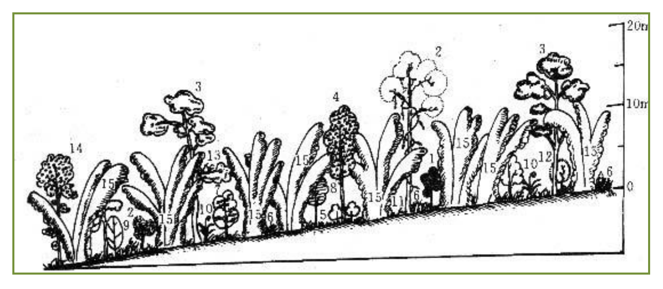
Figure 10. Composition of a natural D. membranaceus community: 1. Bauhinia variegata ; 2. Dalbergia assamica ; 3. Stereospermum terragonum ; 4. Spondias pinnate ; 5. Ardisia solanacea ; 6. Microstegium ciliatum ; 7. Deospermum gracilentum ; 8. Aporusa villosa ; 9. Mallotus philipinensis ; 10. Cyclosorus molliusalus ; 11. Milletlia spp.; 12. Dendrobium spp; 13. Toone sureni ; 14. Toona ciliata ; 15. Dendrocalamus membranaceus (source: Yuming & Chaomao, 2010, p.70).

Enriching bamboo forests should ideally be based on the inclusion of other plant species local to the area, and of all structural types (upper storey, mid-storey, shrub layer and ground-cover/grass layer). The publication, China's Bamboo (Yuming & Chaomao, 2010) describes various bamboo communities in China, and a description of one of them, Dendrocalamus membranaceus , demonstrates the richness of its floral species. The formation of the D. membranaceus community includes 58 families, 132 genera, 165 species of spermatophyte; 6 families, 6 genera, 8 species of ferns; as well as many species of moss (Fig. 10).