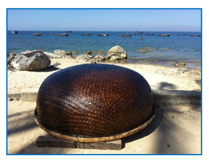
Figure 1. Traditional Vietnamese bamboo coracle (thúng chai).

In the countries where bamboo mainly occurs, Asia and Central and South America, the range of species and its usefulness have led to an extensive range of traditions and customs, and Japanese, Chinese and Indonesian legends abound in stories symbolizing bamboo as energy,