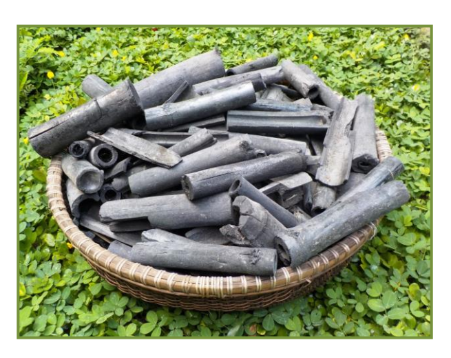
Figure 2. Bamboo charcoal.

The relatively high cellulose and low lignin content of bamboo makes it suitable for