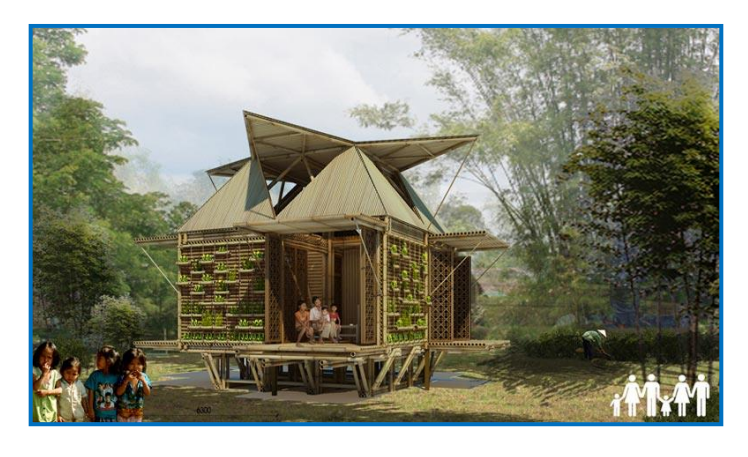
Figure 3. Floating bamboo low-cost house by H & P Architects.

Bamboo has been used in Vietnamese traditional housing for a very long time, and still is being used for housing in many parts of the country, and in particular by minority ethnic groups (California State University, 2015; Vietnam Culture, 2015). Climate-smart housing using bamboo has been underway in South America over the last few years. The designs provide houses which are of low cost, disaster-resistant, quick to build and comfortable to live in (INBAR, 2014). The bamboo bahareque house construction traditions from the