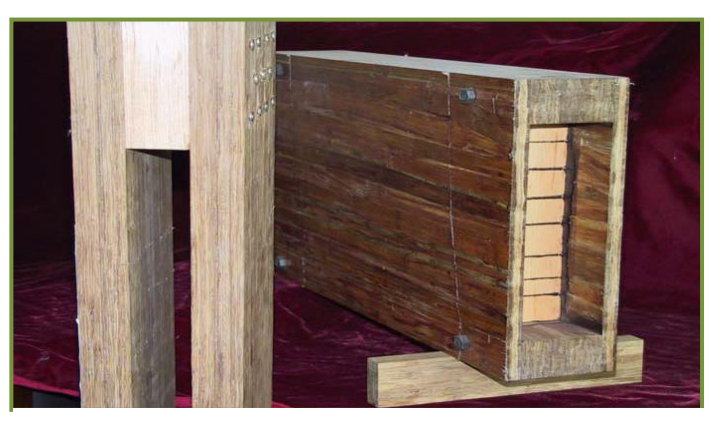
Figure 4. Moulded bamboo structural components - box-beam and splint-column made from bamboo laminated panels (fig. 2 from Wang & Guo, 2014).

Bamboo has been used in construction from times immemorial (Yuming & Chaomao, 2010), and still is, and in areas where it does not naturally occur, it is becoming ever more popular as an attractive and ecological building material for product and interior design (Uffelen, 2015). With technical advancement, new bamboo products are available: bamboo panels, knockdown bamboo furniture, processed bamboo flooring, pulp and paper and bamboo textiles (INBAR, 2014) (Fig. 4). Bamboo is also used for fencing, slats