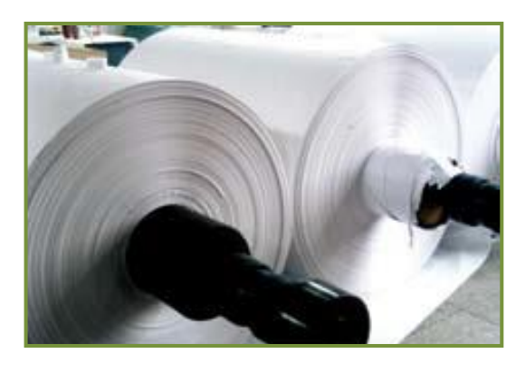
Figure 7. Paper from a Chinese factory from Kaiyuan, Yunnan (from Yuming & Chaomao, 2010, p.173).

Using bamboo for textile manufacture is a form of engineering for sustainable development (Waite, 2009). The advantages of bamboo fabric are its very soft feel (chemically manufactured), or ramie-like feel (mechanically manufactured), its anti-microbial properties, its moisture-wicking capabilities and its anti-static nature. The main constraints for bamboo are costs, and those typical of the textile industry – energy, water and chemical requirements - which could be addressed through closed-loop manufacturing, eco-chemicals, water-recycling, and economic tools such as full pricing (Waite, 2009).